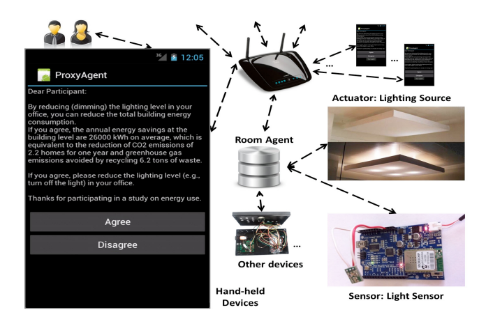
Figure 2: Agents & Communication Equipment in SAVES. An agent in SAVES sends feedback including energy use to occupants.

autonomy - when to interrupt a user and when to act autonomously.