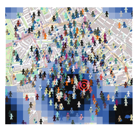
Figure 2: Visualisation of data aggregation. Lines between users (not to scale) indicate data aggregation, adjacent users with the same colour indicate a cluster where only one in that cluster is providing data. Rainclouds are indicated with blue and black squares.

We have constructed a simulator of a new request driven social sensing crowdsourcing system, which incorporates checking use policies against requests, modeling strategic behaviour of self-interested users and smart network selection. This tool allows checking the influence of each of these component's functionality on the total system performance, defining performance as the number of requests per time unit that are satisfied to a certain extent and measuring it. We can also test the relationship between user behaviour and what is specified in their use policy and requests. This