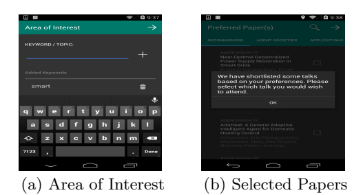
Figure 1: Screenshots of PRESS

Copyright © 2016, International Foundation for Autonomous Agents and Multiagent Systems (www.ifaamas.org). All rights reserved.