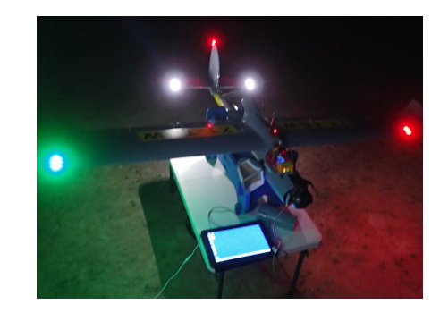
Figure 1: A conservation drone currently used for real-world deployment.

In important domains like conservation and public safety, the real-time information provided by these sensors (e.g., drones) is becoming increasingly important. To help plan for strategic deployments of sensors and human patrollers, as well as warning signals