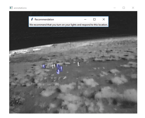
Figure 3: Example of providing a real-time security recommendation based on an image detection.

we produced approximately 62,000 labeled frames. We then developed SPOT [4], the first (to our knowledge) aerial thermal detector for wildlife and poachers. SPOT has recently been deployed to help ease the burden on park rangers in a real-world park , whose name is hidden to protect wildlife. A conservation drone used during deployment is shown in Fig. 1.