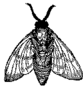
Figure 2: A sample black and white graphic that has been resized with the \includegraphics command.

“floating” placement of tables, use the environment figure* to enclose the figure and its caption. and don’t forget to end the environment with figure* , not figure !