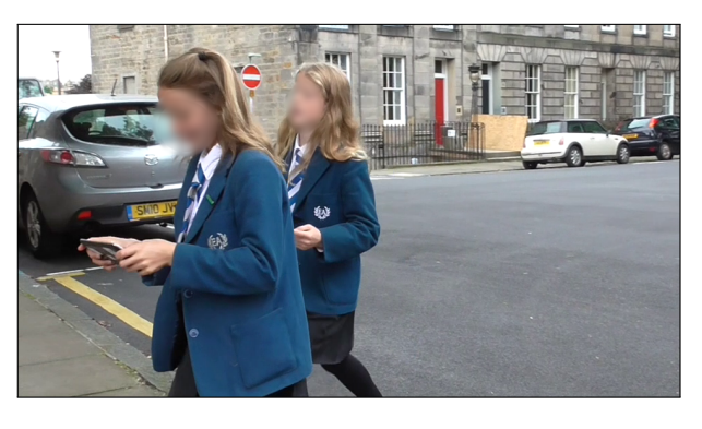
Figure 1: Students carrying out the treasure hunt

Appears in: Proceedings of the 14th International Conference on Autonomous Agents and Multiagent Systems (AAMAS 2015), Bordini, Elkind, Weiss, Yolum (eds.), May 4–8, 2015, Istanbul, Turkey. Copyright © 2015, International Foundation for Autonomous Agents and Multiagent Systems (www.ifaamas.org). All rights reserved.