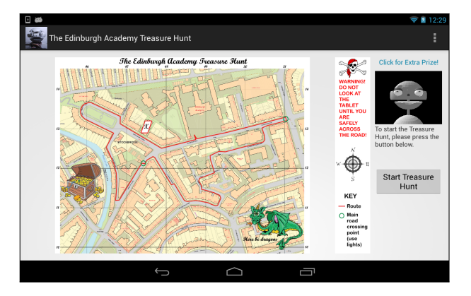
Figure 2: The Android application for the treasure hunt

given a map on paper, along with a paper-based questionnaire listing the steps to follow and the multiple-choice questions to answer. For the purpose of the current study, we implemented an Android application for the treasure hunt (Figure 2), keeping the features of the application as close to the paper version as possible. In particular, all images, fonts and layout are comparable between the two versions, and the application displays a map corresponding to its paper counterpart and presents a sequence of the same steps as in the paper version to be carried out by the students. The application also includes a virtual robot head which presents the navigation instructions, poses the questions, and gives feedback on the correctness of the students' answers; depending on the application settings, this feedback could be either neutral ("correct", "incorrect") or affective (e.g., "well done", "too bad").