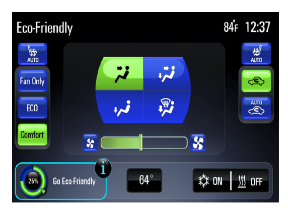
Figure 1: Main screen.