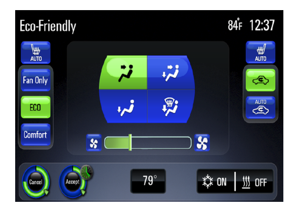
Figure 2: Advised screen.

In order to have a variety of advice and drivers' responses, we had to develop algorithms for repeated advice provision. The goal of these algorithms was to simulate varying interactions between the agent and different subjects. Simulating different interactions is challenging. The time with each driver is limited, thus testing all possible advice in every possible order is impossible. Consequently, we needed to collect