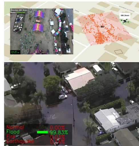
Figure 3: Computer vision-based detection in the AIDERS platform.

vision detection pipeline enables simultaneous crowd localization and disaster classification, allowing search and rescue teams to identify high-density areas and assess disaster types in real time. The platform also integrates predictive algorithms for fire spread modeling. Furthermore, the AIDERS platform supports real-time mosaic mapping, and offline orthophoto and 3D model generation.